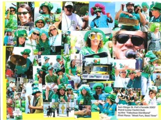
San Diego St. Pat's Parade 2007 Point Loma Yacht Club with the "Fabulous Dan Band" First Place "Most Fun, Best Time"

Later in the day the more determined of us went to the PLYC Clubhouse to continue the party, but that's another story.